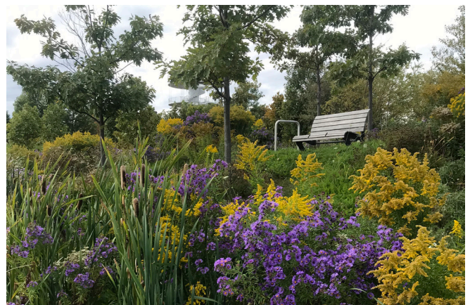
Native Species Garden at Trillium Park, Toronto, Ontario (2022).

amplify the Institute’s influence in teaching, research and advocacy to address the climate crisis by embedding Sustainability and Climate Action into our curriculum and teaching, research, governance, and facilities and services”. As one of the world’s leading faculties of education, OISE’s Sustainability & Climate Action Plan plays a unique role within climate action with a strong focus advancing environmental and sustainability education at the University of Toronto, across Ontario