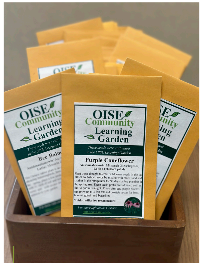
Seeds donated to the OISE Library’s Seed Library by the OISE Community Learning Garden team (2024).