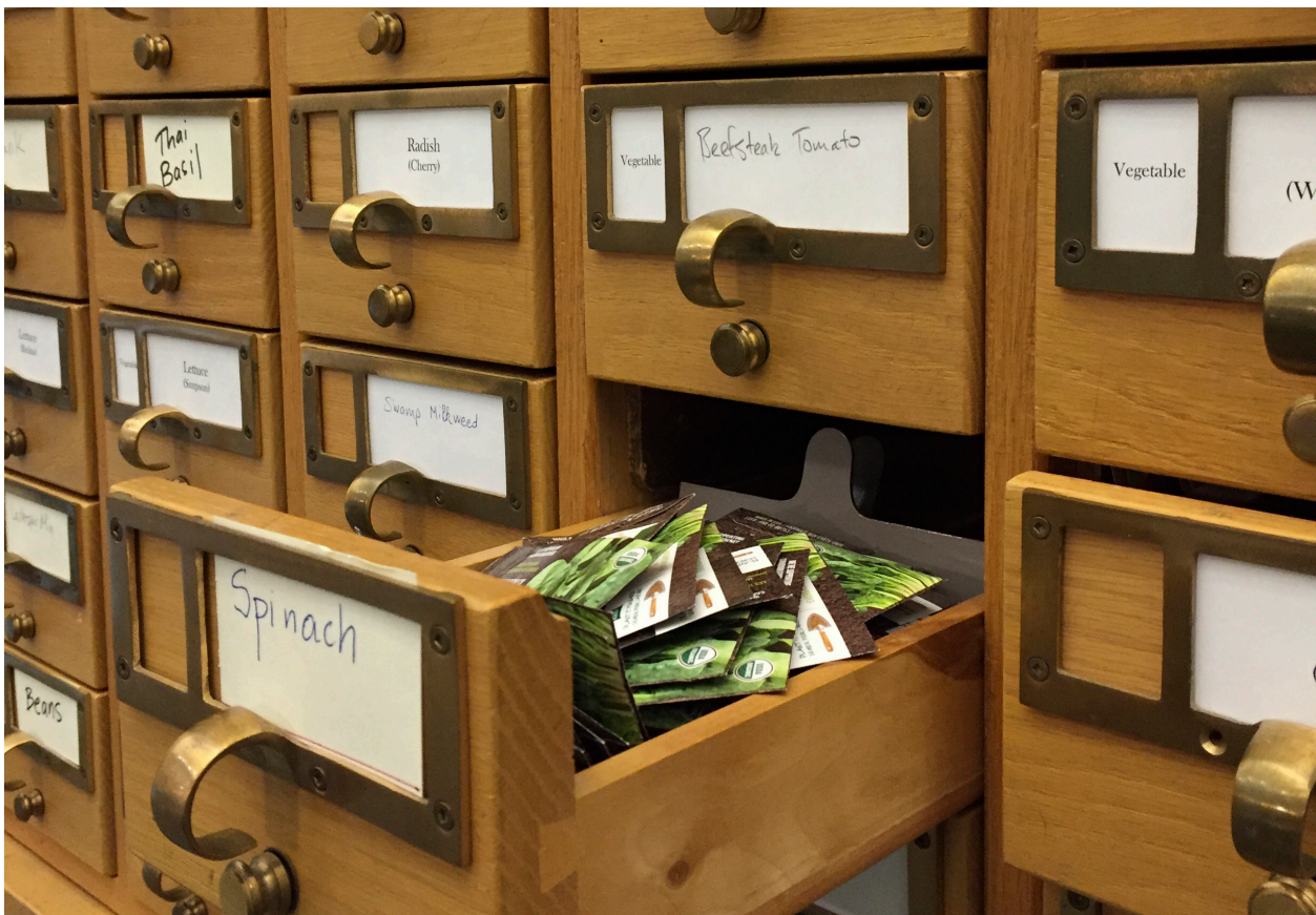
Photograph of the OISE Library's Seed Library.